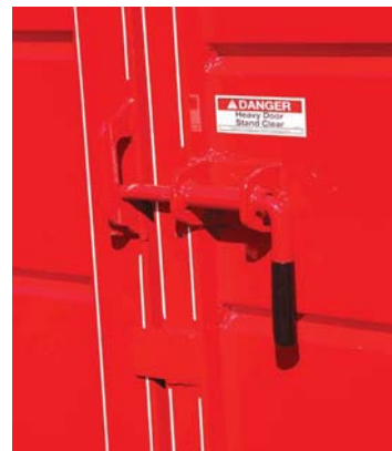
Easy-to-Use Latch Design – Escape Door