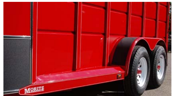
New Running Board Design